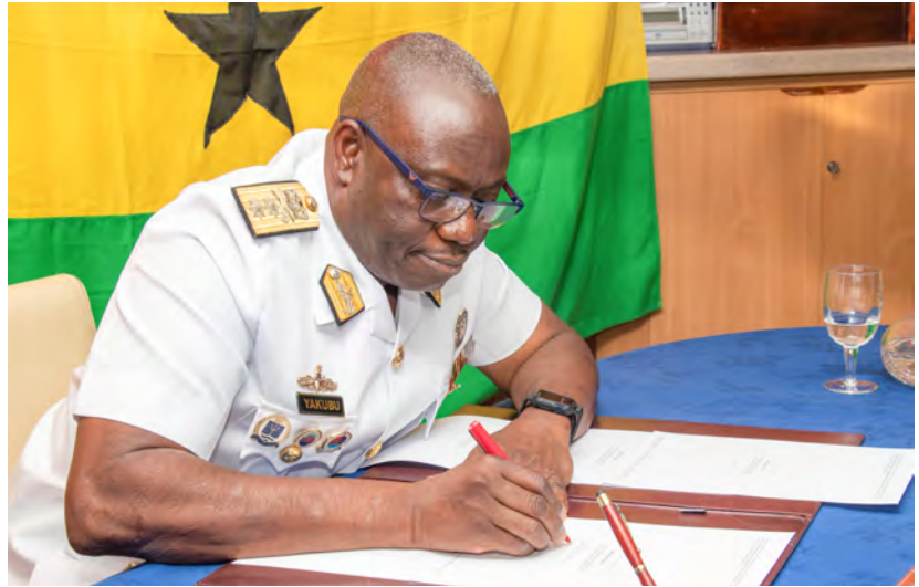
CNS signing the Note of Accession