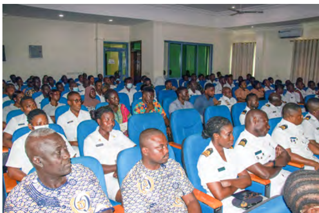
Congregants at the Owusu Ansa Hall