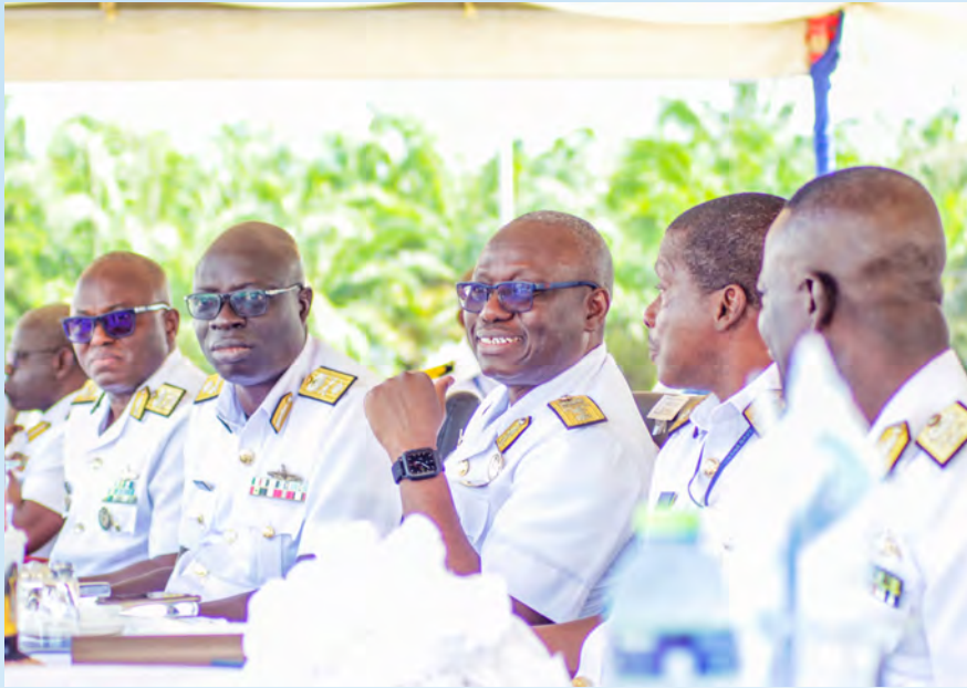
CNS (middle) with some FOC's and Directors at the WNC WASSA