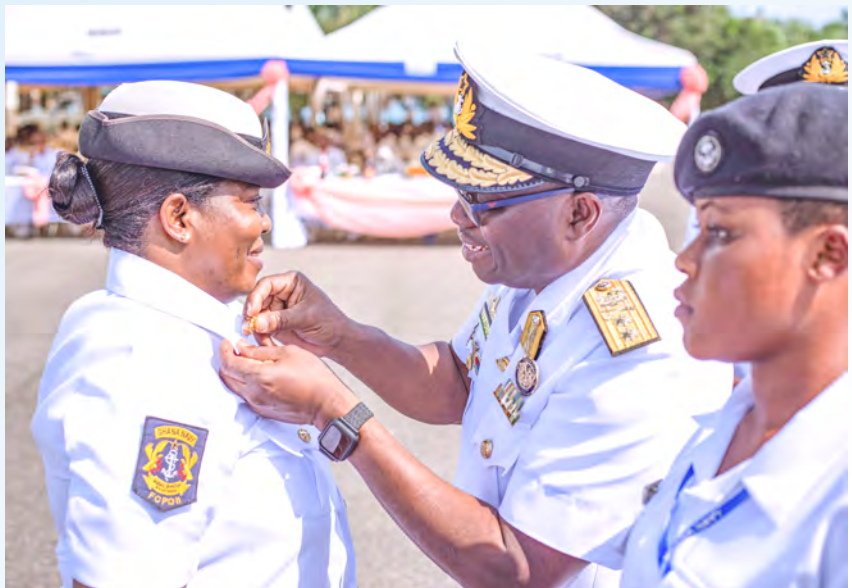
CNS decorating a Fleet Chief Petty Officer with a Lapel