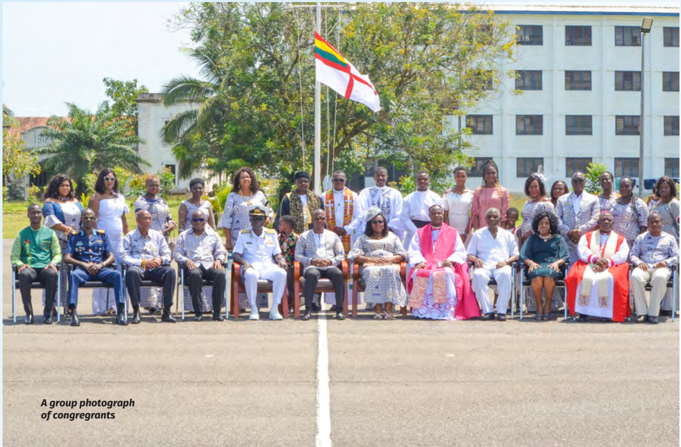
A group photograph of congregants