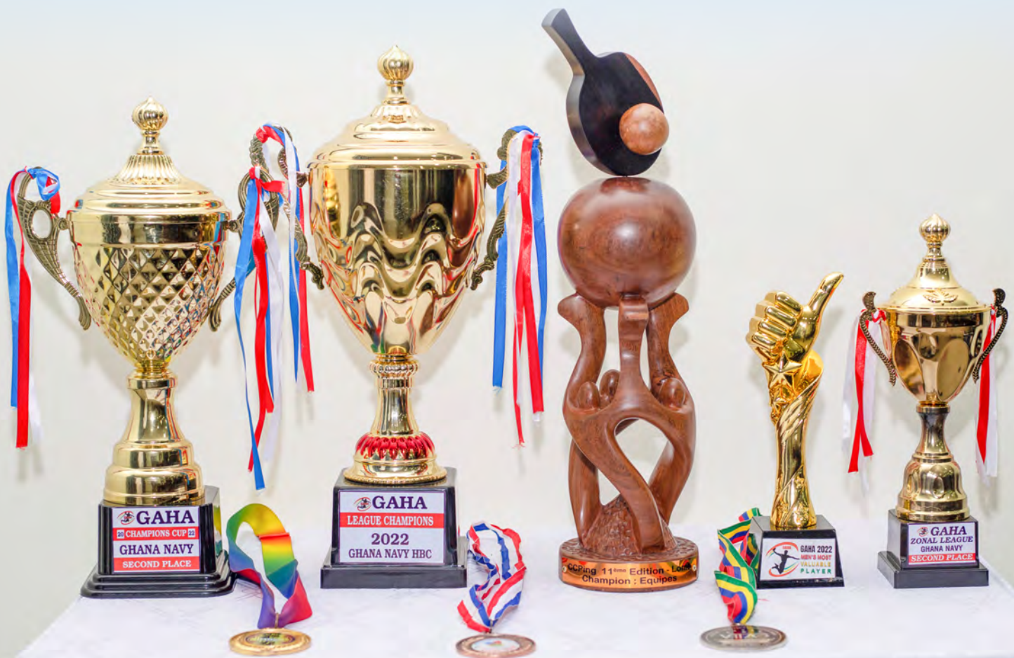
Trophies won by the Naval Sports Teams