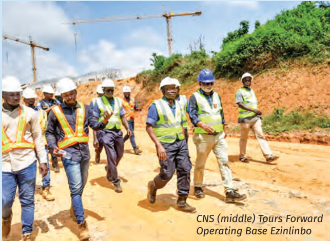
CNS (middle) Tours Forward Operating Base Ezinlinbo