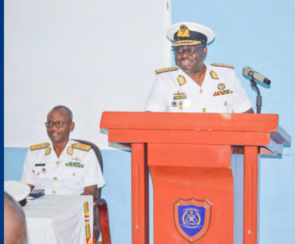
The CNS addressing participants of the Young Officers Convention