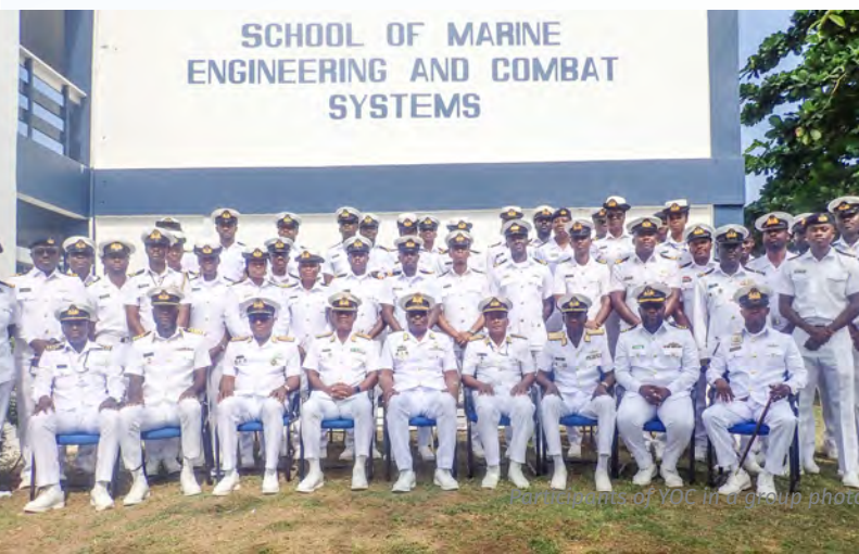
Participants of YOC in a group photograph with CNS and some Directors

Some topics treated were Understanding the Vision of the CNS, Military Discipline, Expectations of Command, Enhancing Leadership Qualities of Young Officers, Challenges of Command, the Role of the Young Officer among others.