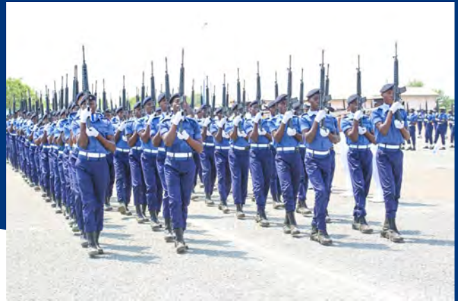
Recruits in a Drill display

A total of 335 Recruits made up of 243 males and 92 females passed out of the Naval Recruit Training School (NRTS) at the Naval Training Command, Nutepkor in Sogakope on 27 January 2023.