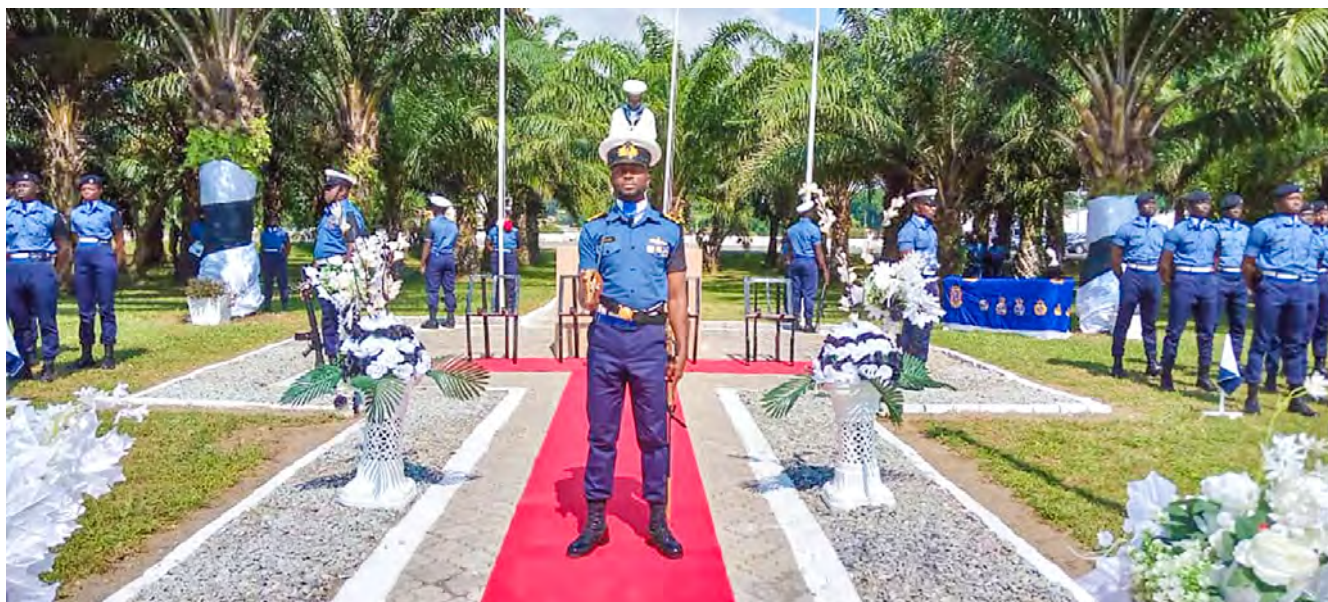
Cenotaph Guard in position

He stated that many Officers and Ratings had paid the ultimate price with their lives on peace keeping operations in South Sudan, the Democratic Republic of Congo and some conflict-ridden areas.