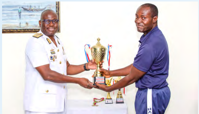
The Coach of the Handball Team presenting the trophy to the CNS