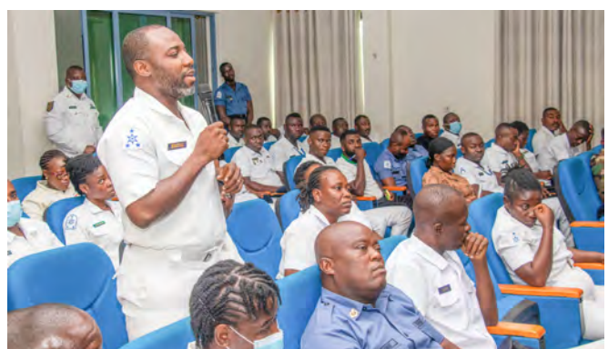
Interactive session with the CNS