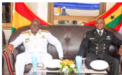
CNS (left) With outgoing Master Coxswain