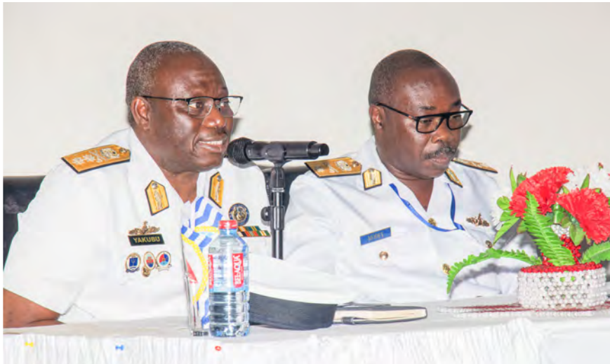
CNS (left) with CSO at the Durbar