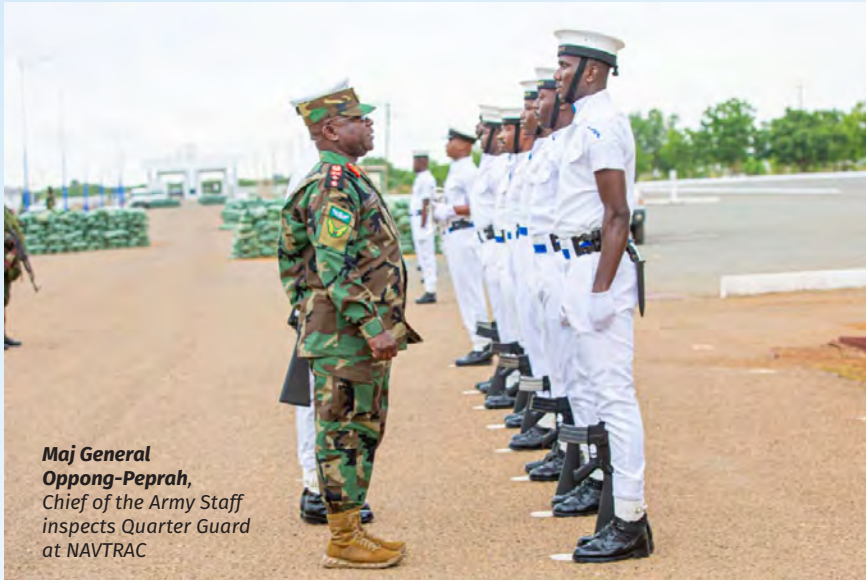
Maj General Oppong-Peprah, Chief of the Army Staff inspects Quarter Guard at NAVTRAC

Eight operatives were adorned the Special Forces badge. They have thus advanced into Ghana Navy's Special Boat Squadron (SBS) after successfully completing the maiden 6-month Boat Squadron Basic Operative Capability Course 1/22 at the Naval Training Command (NAVTRAC), Nutekpor, Sogakope, on 15 September 2022. Although the course began with 25 trainees, only 8 were able to make it through the 6 months training.