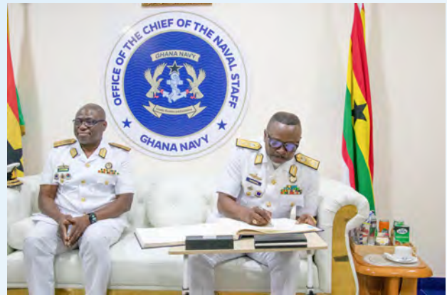
CDS signing the Visitors book at the Naval Headquarters