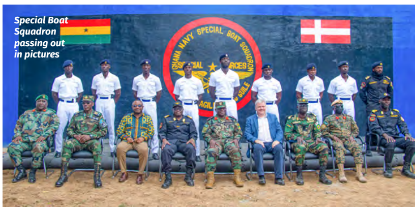
Special Boat Squadron passing out in pictures