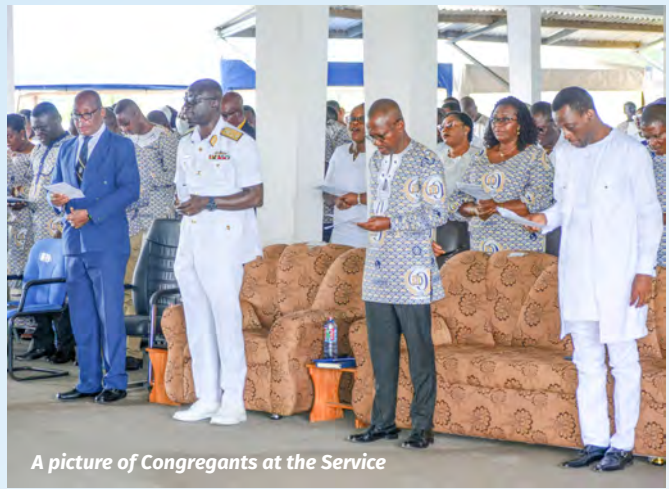
A picture of Congregants at the Service