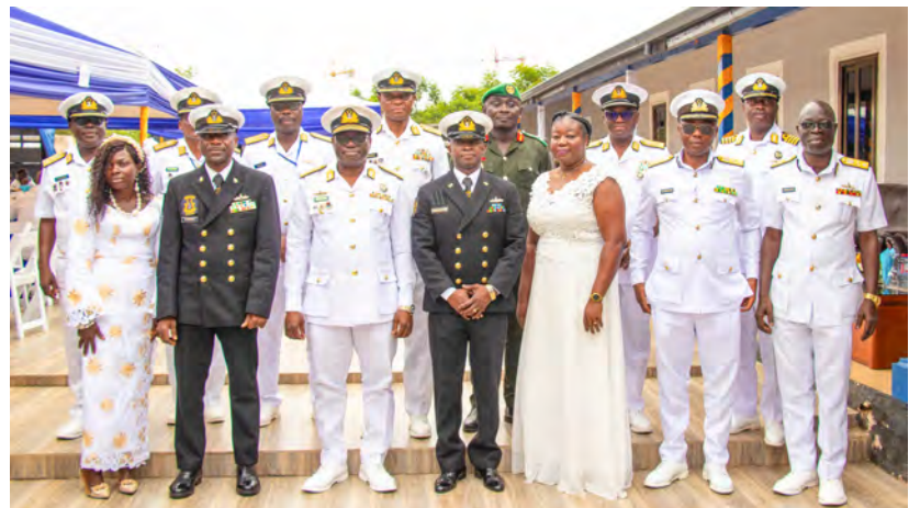
CNS in a photograph with outgoing and newly appointed Master Coxswains with their spouses and Senior Officers