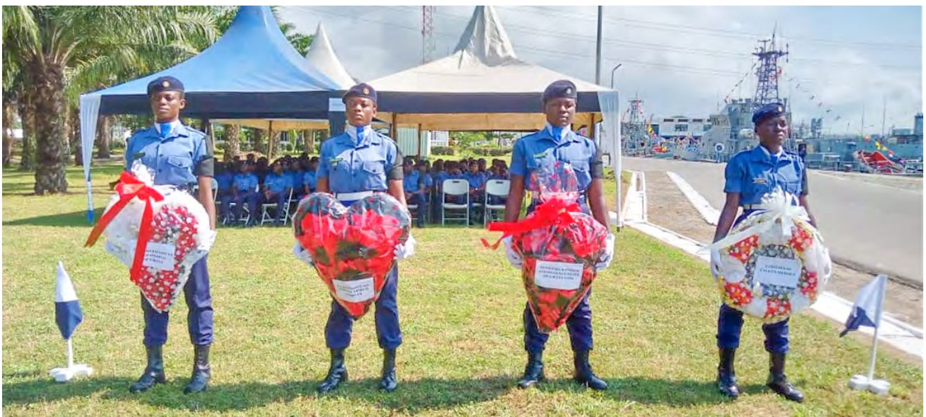
Wreath bearers on Parade