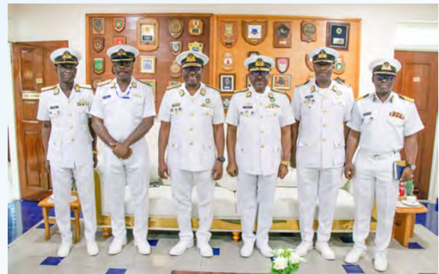
CDS, CNS and some Directors at the Naval Headquarters

The CDS was welcomed by some Directors at the Naval Headquarters.