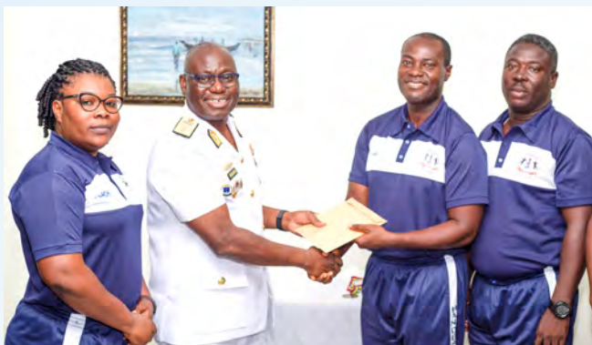
CNS presenting a token to the Team