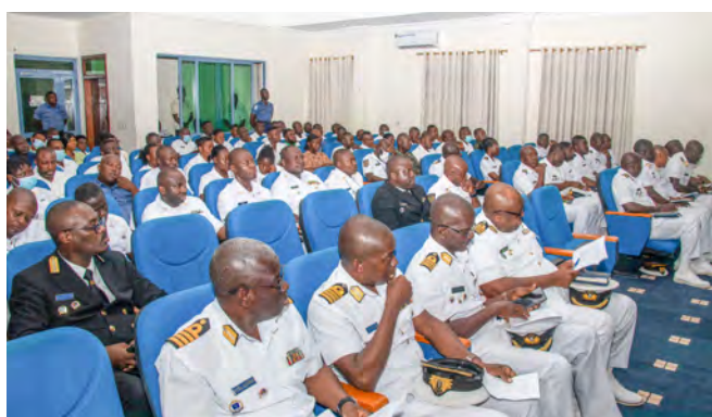
Directors, Officers and Ratings seated at the CNS Durbar