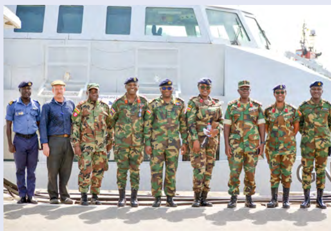
DG (MED), FOF and Some Senior Officers at the WNC