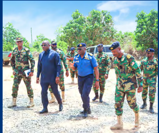
Minister for Defence and Chief of the Naval Staff visit Naval Training Command