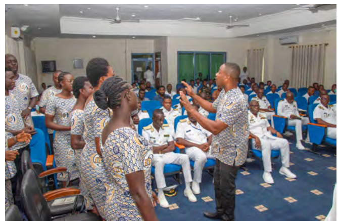
Ghana Navy Choir performing during the Religious Service