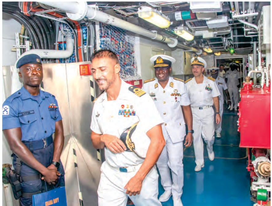
CNS on a tour on ITS BORSINI