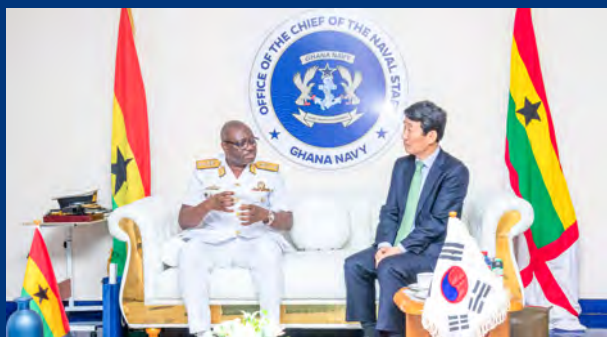
Deputy Minister for Consular Affairs and Overseas Koreans, HE WJ Kim visits Naval Headquarters