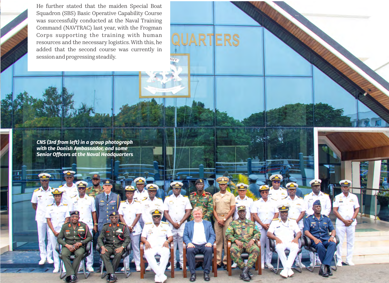
CNS (3rd from left) in a group photograph with the Danish Ambassador, and some Senior Officers at the Naval Headquarters