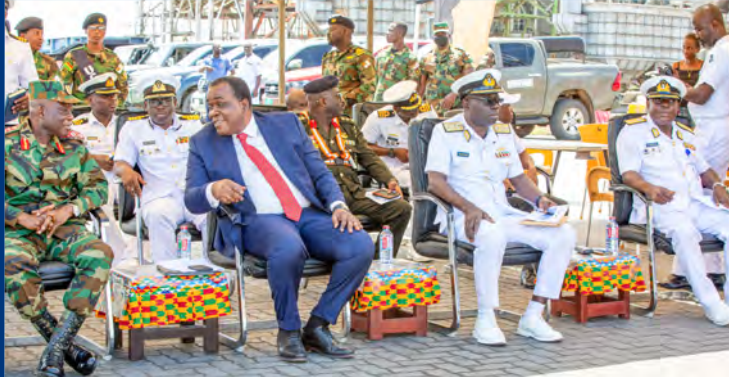
Receipt of drones from GNPC and Ghana Boundary Commission